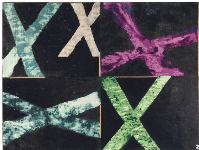
1. STRADA IN BLUE CARPET, ONE OF EIGHT DESIGNS FROM FORT STREET STUDIO'S NEW PROGETTO PASSIONE COLLECTION, DEBUTING IN COLLABORATION WITH SOTHEBY'S THIS MONTH. 2. CANTO IN COLOR RUG. 3. LULU IN LIGHT RUG.