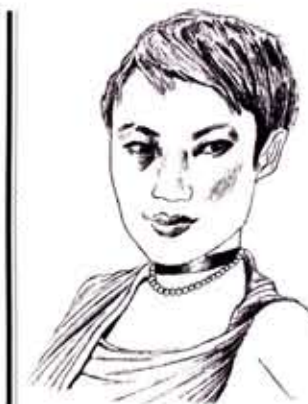
4. Glimmering Dawn 5. Scratchpad Sienna 6. Sign Night

TASTEMAKERS Han Feng FASHION DESIGNER hanfeng.com